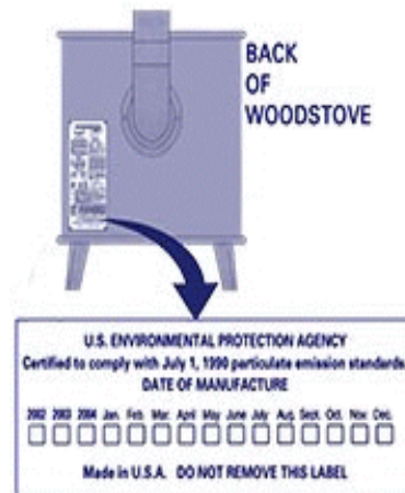
Permanent Wood Stove Label

Wood stoves offered for sale in the state of Washington must meet a particulate emissions limit of 4.5 grams per hour for non catalytic wood stoves and 2.1 grams per hour for catalytic wood stoves.