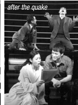
after the quake