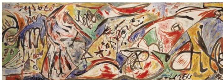
Pollock, The Water Bull.

For more information call 415/357-4000 or visit sfmoma.org . To plan your BART trip, visit bart.gov