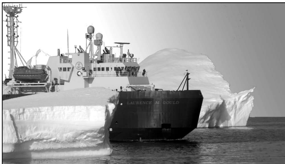
The Research Vessel Laurence M. Gould near the Antarctic Peninsula.