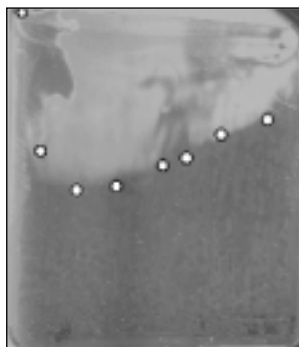
Using a single sample, NCMC techniques yield a complete polymer-blend phase diagram that shows the influence of systematic changes in temperature and blend composition.

The NCMC is a vehicle for collaboration, the means to leverage personnel, facilities, and capabilities. Sharing of expertise, resources, and information reduces obstacles to participating in the fast-moving, instrument-intensive area of combinatorial materials science. Collaboration also encourages cross-fertilization of ideas and research strategies, which can lead to new insights and spur progress on many fronts—across organizations, disciplines, and interests.