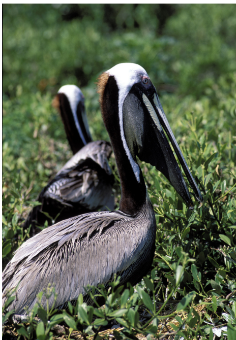
Ryan Hagerly, USFWS

With the advent and widespread use of pesticides such as DDT in the 1940s, pelican populations plummeted due to lack of breeding success. When pelicans ate fish contaminated with DDT, the eggs that they laid had shells so thin that they broke during incubation.