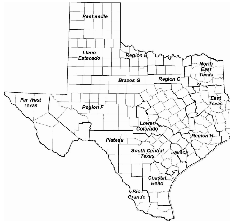
Regional Water Planning Groups