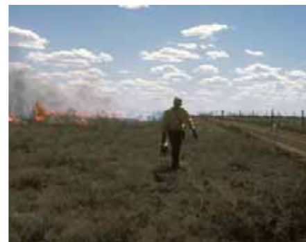
TEXAS TECH UNIVERSITY