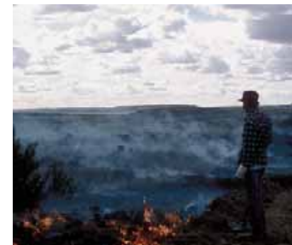
TEXAS TECH UNIVERSITY