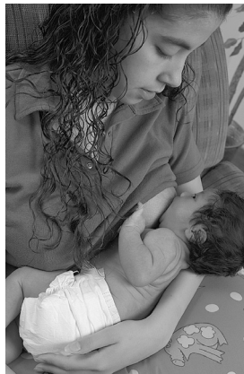
Figure 1. Nursing mother holding infant in a cradle hold.

If the mother is feeding from the right breast, her right arm supports the baby, and her left hand supports her breast. The baby is lying across the mother's front. This is reversed when she feeds from her left breast.