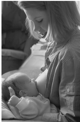
Figure 3. Nursing mother holding infant in a football hold.

If the mother is feeding from her right breast, her right arm supports the baby. The baby is on the mother's side, under her arm. The baby's tummy is pressed against the side of her body. The infant is positioned, flexed at the hips, with feet tucked up, not pressing against a chair or bed. If the baby's feet touch a surface, the infant may push off, possibly causing the mother to think that her baby doesn't want to nurse and making it difficult to maintain latch-on. Flexing the baby at the hips also encourages the baby to relax his jaw and open his mouth.