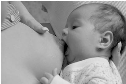
Figure 6. Baby's mouth touching nipple.