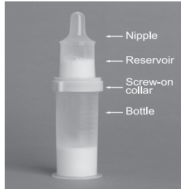
Figure 12. Haberman feeder.