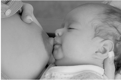
Figure 5. Beginning latch-on sequence.