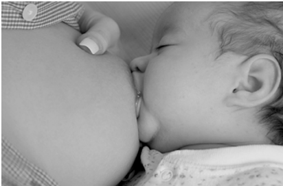
Figure 8. Baby's chin pressing into mother's breast.