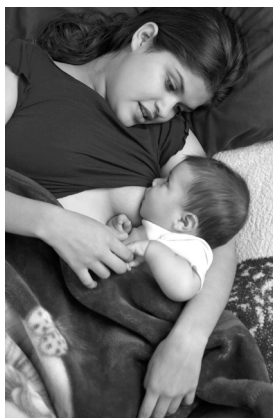
Figure 4. Mother and baby demonstrating the side-lying hold, nursing from left breast.

If the mother is feeding from her right breast, her right arm supports the baby, and her left hand can support her head. The baby lies on its side with the mother's hand, arm, small pillow, or a rolled-up towel behind the baby's back for support. The baby faces the mother, mouth in line with her nipple, chin indenting her breast. Extra pillows behind the mother's back and between her knees are also helpful.