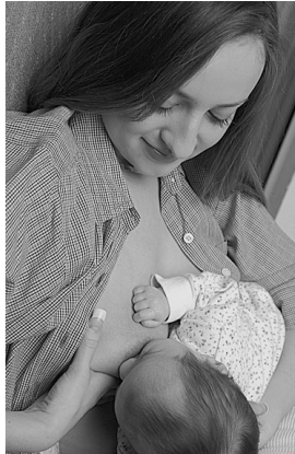
Figure 2. Nursing mother holding infant in a cross-cradle hold.

If the mother is feeding from the right breast, her left arm supports the baby, and her right hand supports her breast.