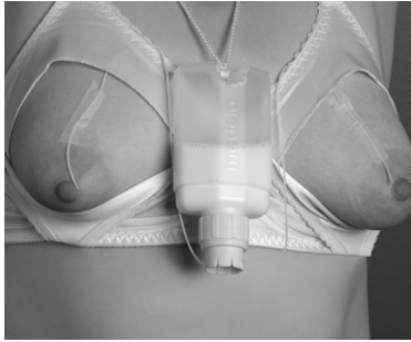
Figure 11. Supplemental nursing system.