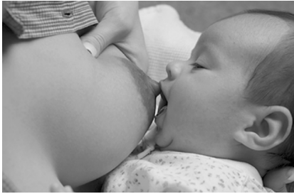
Figure 7. Baby achieving latch-on.