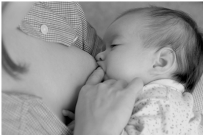
Figure 9. Gently breaking suction seal.