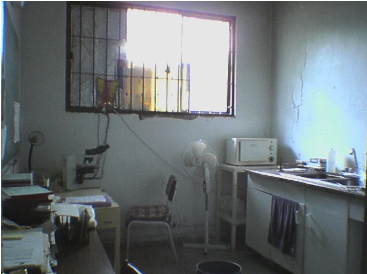
TB Laboratory Nuevo Laredo Health Department