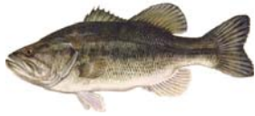
Largemouth bass All black bass spp.

Freshwater fish which are more likely to build up mercury.