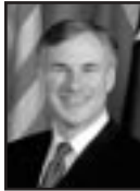
GREG ABBOTT Attorney General of Texas

Cash payments can be made at participating retail locations, and are an alternative to mailing checks or money orders for child support obligations. The retailer will charge a fee for this service.