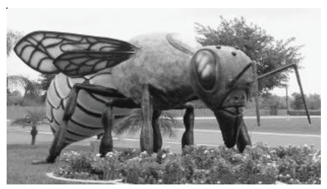
Hidalgo, Texas (Hidalgo County) is home to "The World's Largest Killer Bee," a statue built to commemorate the first colony of "Killer" Bees discovered in the city.

Either gentleman would have a hard time filling the 40-foot-tall pair of concrete cowboy boots sitting outside North Star Mall in San Antonio. However, if Tex or Sam needs a new chapeau, one can be found in Paris (Texas, of course) atop what is billed as the "Second Largest Eiffel Tower in the Second Largest Paris." Although the 65-foot replica of the famed Parisian landmark has been surpassed by a taller tower in Las Vegas, the Nevada version does not boast a jaunty red Stetson, itself 4 ½-feet tall. And if Tex and Sam needs to rest after his travels, he can sit a spell in the Star of Texas Rocker, a nearly 30-foot tall cedar rocking chair near Lipan.