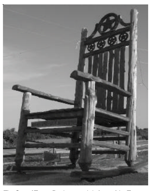
The Star of Texas Rocker stands in front of the Texas Hill Country Furniture and Mercantile, a rustic home-furnishings store outside Lipan, Texas (Hood County).

stupendous strawberries, from one painted on top of its 130-foot water tower to a seven-foot-tall cement replica in front of its fire department. Sequin, which boasts that it is home to the world's largest pecan, displays the five-foot-long nut in front of its city hall. The top of Luling's water tower has been decorated to look like a massive watermelon.