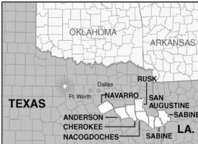
Map of where shuttle debris was found in Texas.

When asked if a disaster plan was implemented during this tragic event, Judge Kennedy responded, “We had just completed the draft of our Hazard Mitigation Plan. The process of developing the plan ended up being more valuable than the plan itself. All of