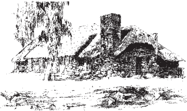
CCC Refectory with original palmetto thatch roof