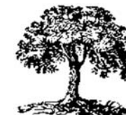
Live Oak Quercus sp.

Park Reservations (512) 389-8900 www.tpwd.state.tx.us