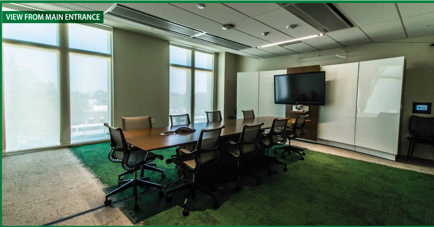
VIEW FROM MAIN ENTRANCE