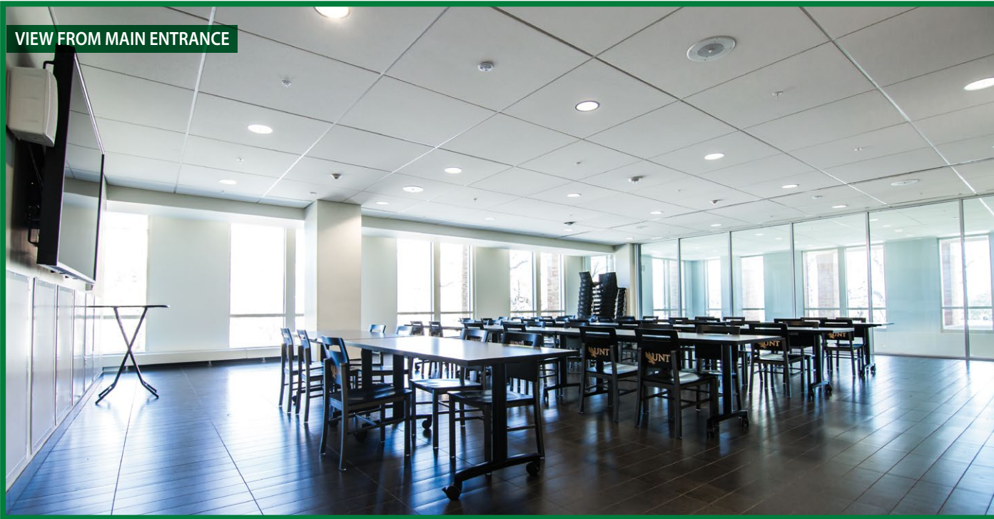
VIEW FROM MAIN ENTRANCE