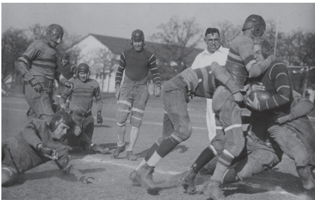
A Look Back: 1913 – Intercollegiate football begins at North Texas State Normal College.