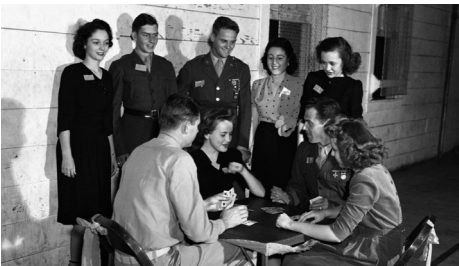
A Look Back at 1942: Students playing cards at the North Texas State Teachers College.

5. Tell everyone one fun fact about you? I rode horses for years and was featured in the Farmer's Almanac with my horse Blaze years ago. (Not going to say what year!☺)