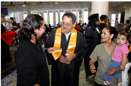
A proud graduate of UNT Dallas.