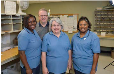
The hardworking mailroom staff at the UNT Health Science Center.

BUSINESS SERVICE CENTER UNT SYSTEM Shared Services. Shared Success.