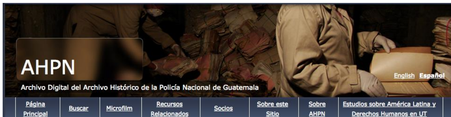
Figure 4. Screen shot.

Finally, it's noteworthy to mention that the archive is Bilingual (English/Spanish) and that there is a "Spanish" pointer on the upper right hand side of the dashboard as seen on Figure 4: