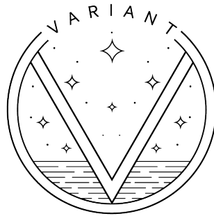
MUSIC GALA 2019

The University of North Texas College of Music is dedicated to increasing scholarship opportunities for our students. The Fundraising Gala provides an opportunity for you to experience our College of Music, while providing students the ability to obtain much-needed scholarships.