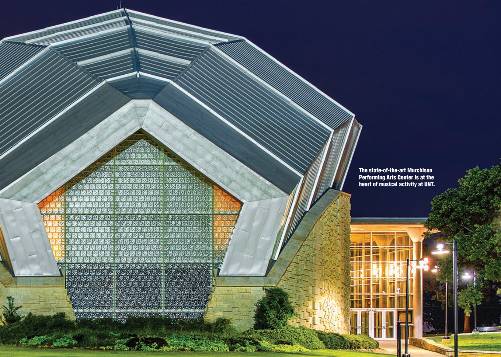
The state-of-the-art Murchison Performing Arts Center is at the heart of musical activity at UNT.

Interact with more than 100 internationally acclaimed guest artists and lecturers each year, and build a professional network that includes peers, faculty and distinguished alumni who will become your friends and collaborators throughout your career.