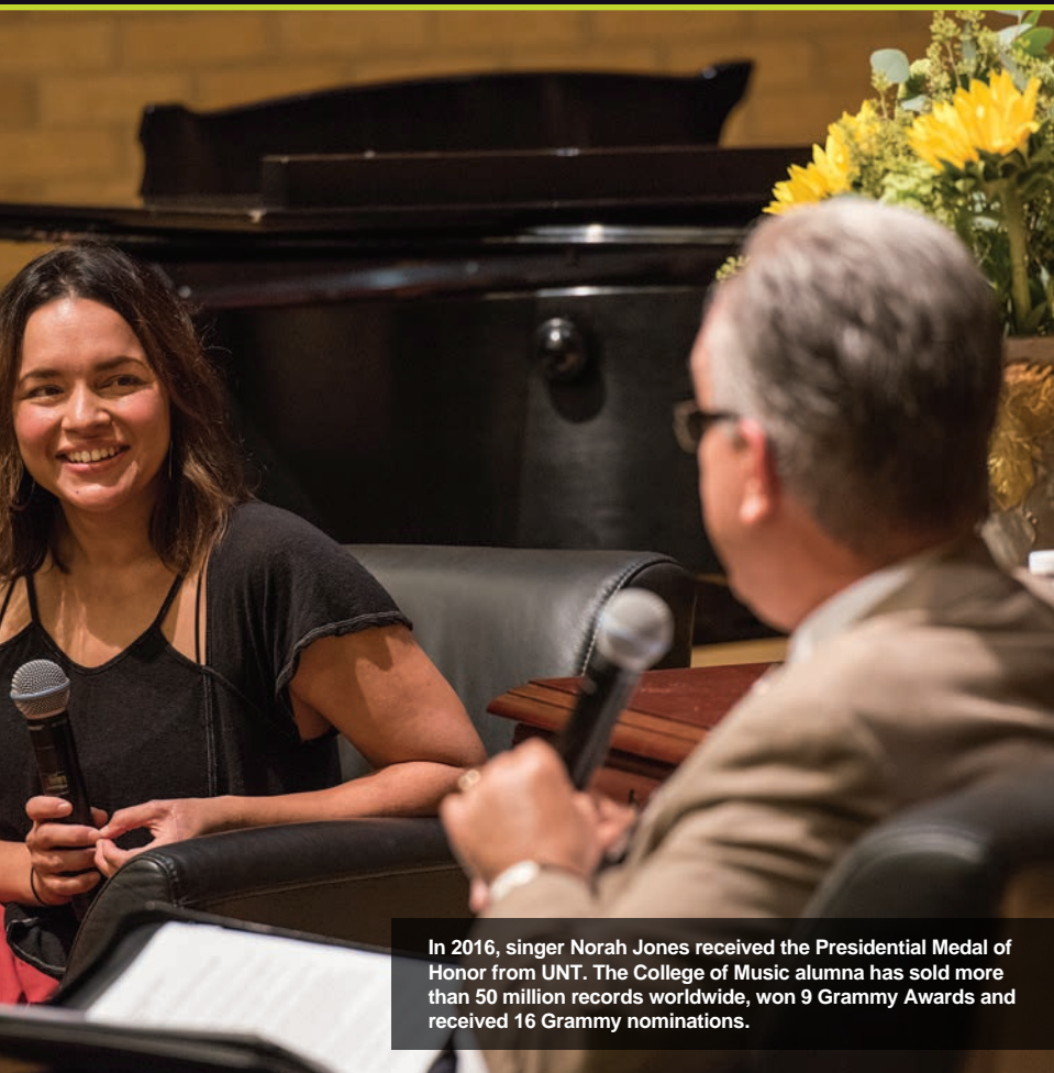
In 2016, singer Norah Jones received the Presidential Medal of Honor from UNT. The College of Music alumna has sold more than 50 million records worldwide, won 9 Grammy Awards and received 16 Grammy nominations.