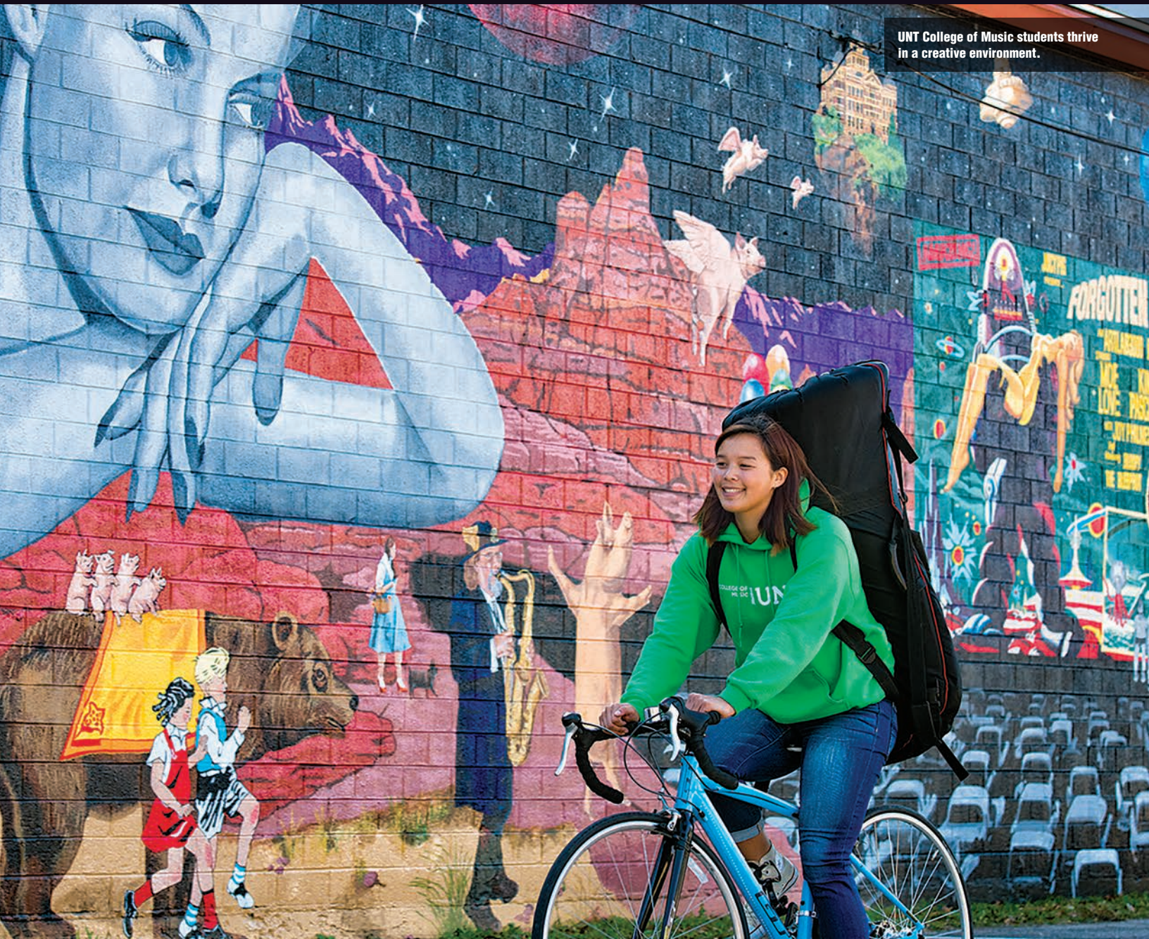
UNT College of Music students thrive in a creative environment.