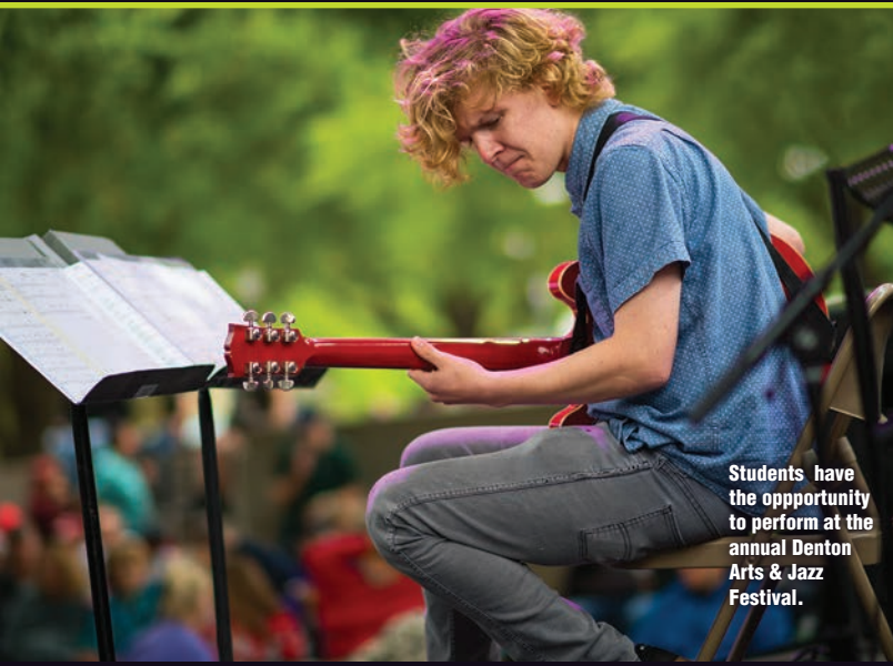
Students have the opportunity to perform at the annual Denton Arts & Jazz Festival.