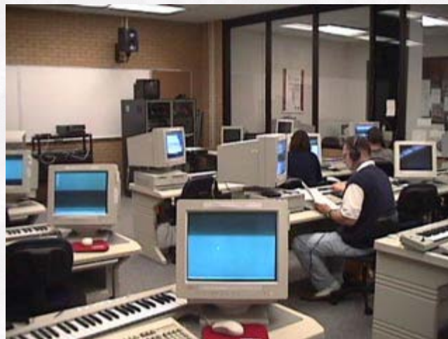
The College of Music Lab has a variety of creative digital equipment available for use

A visit to the College of Music lab and the School of Visual Arts lab provides a potential Stephen Spielberg, George Lucas, Wendy Carlos, or Danny Elfman with everything needed for creative fame and fortune. Featuring some of the