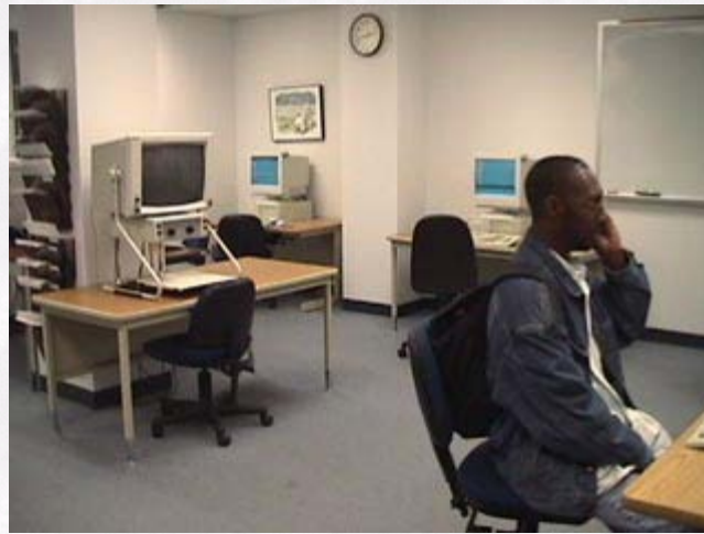
The Adaptive Lab is located in Chilton Hall

Another enhanced general access lab is the Adaptive Lab located in Chilton Hall, room 116. Equipped and staffed to meet the specific needs of UNT students with disabilities, the lab currently includes twelve Pentium II computers with 17-inch monitors, CD-ROM drives and zip drives. Two laser printers, a Braille printer and a scanner for text and pictures are also available. Adaptive equipment includes a Chroma Color TV, ergonomic keyboards and mice, and a screen polarization filter. In addition to the generally available software, specialized software includes JAWS (a screen reader), Megadots (Braille software for texts), Dragon Naturally Speaking (voice recognition), Zoom Text (screen enlarger) and Paperport (scanning and conversion software).