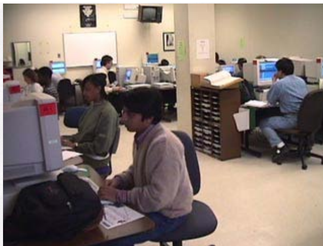
The ACS Lab offers Linux machines

If a student is curious about the buzzwords "Linux" and "Open Source Movement" and what they mean for the future, he or she can check out the machines running the Linux operating system in the Academic Computing Services general access lab (ISB 110 - in the Science and Technology Library). The ACS lab is currently the only lab with Linux machines available for the general student population and plans to add even more to its Linux inventory in the next few months due to increased student demand. The ACS lab also features all currently available statistics software packages (S-Plus, SPSS, SAS) on Pentium III 600 MHz machines for optimal use. The statistics software can also be found in the COBA, COE, Chilton Hall, and many of the College of Arts and Sciences (CAS) labs. Additional mention should be made of the lab located in the School of Library and Information Science (ISB 205c) which has been specially designated for graduate student use.