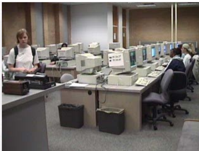
The Willis Library Lab is open 24 hours

This article would not be complete without mentioning one of the favorite lab features on campus: the 24-hour, seven-days-a-week access of the Willis Library lab where even the most ardent procrastinator or night owl can complete his or her project at 3:00 a.m. if needed or desired! The Willis Lab has recently upgraded all of its Pentium-based machines to PIII 800 MHz level with an upgrade of its Macintosh resources planned for next year.