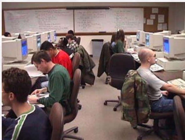
One room of the COBA lab

There are currently thirteen general access labs scattered around campus. These are not to be confused with additional specialty labs where a student might gain access through their major study area. Some of the first labs were established in the College of Business Administration (COBA), the College of Education (COE) and the Willis Library. The most recently built labs include the School of Visual Arts (SOVA), the College of Music Lab (COM) and the Adaptive Lab in Chilton Hall.