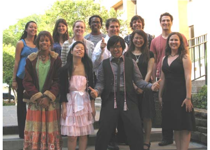
The Japanese Honor Society (College Chapter)