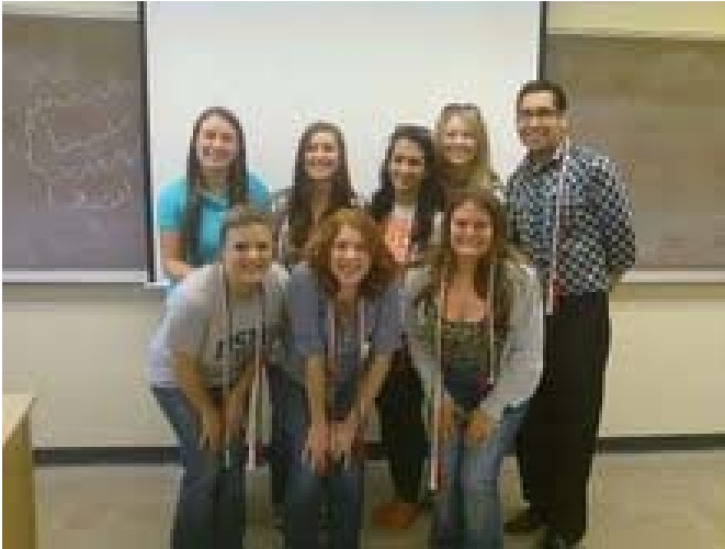
The Italian Honor Society (Gamma Kappa Alpha)