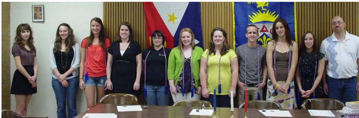
On the left are the inductees of The French Honor Society (Pi Delta Phi).