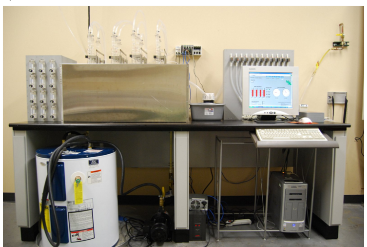
Figure 1: AMUCS for Monitoring Biodegradation

Fortunately, biodegradable plastics have been and are continuing to be developed to replace their petroleum-based counterparts. These biodegradable plastics are derived from naturally occurring polymers, such as cellulose and corn starch, that are readily degradable in compost. However, more research needs to be conducted to develop biodegradable plastics that can withstand their intended purpose but degrade quickly once discarded by the consumer. To further this research, we wanted to build a reliable automated system that can monitor biodegradation and, in the future, even enhance it. As a result, we designed the AMUCS, which meets the ASTM D5338-98 (2003) standard requirements. The AMUCS (Figure 1) consists of three major subsystems.