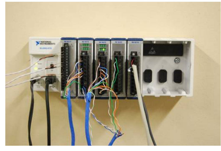
Figure 2: Data Acquisition Hardware—Heart of the AMUCS

We constructed the third subsystem, the hardware control and data acquisition system (HCDAQS), using NI CompactDAQ (Figure 2). The HCDAQS is the central nervous system of the AMUCS. We designed it using LabVIEW to acquire and log data from the resistance temperature detectors (RTDs), acquire data from the mass flow meter and gas analyzer, cycle the solenoid valves of the gas multiplexer, regulate the water bath temperature, and display real-time data to the user via a GUI. We used two architecture techniques to create a LabVIEW program that meets the required criteria. We used a producer/consumer architecture to separate the data acquisition process from the data-logging and water bath temperature regulating processes. We then used state machines to cycle the solenoid valves and to trigger the relay used to control the transfer pump that maintains the water bath temperature.