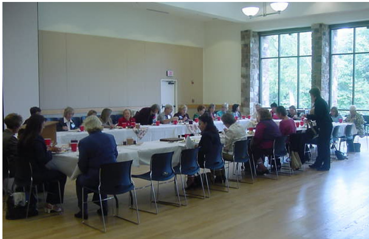
The Lone Star Chapter at their October 6 meeting.