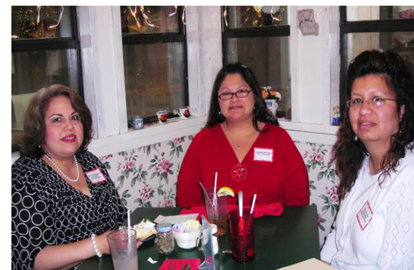
Alamo Chapter clerks at their meeting in March.

There being no further business to discuss, the meeting of the Alamo Chapter was adjourned. ★