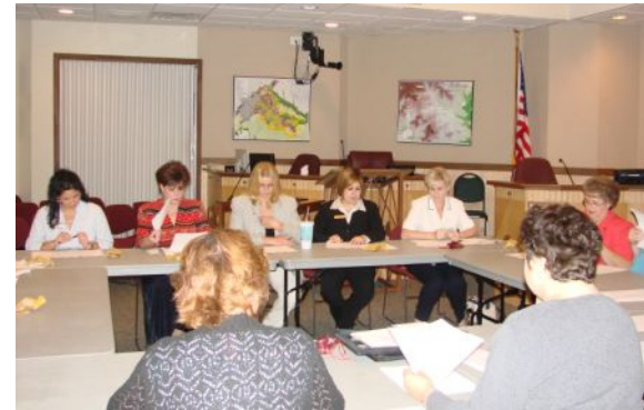
Above: The Capital Chapter at their April 25 meeting.