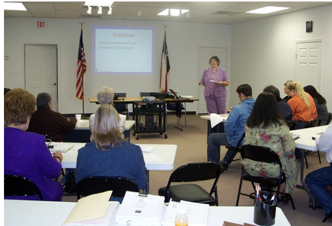
Above and below: The Coastal Bend Chapter at their meeting in Palacios.

Applications are now being taken for clerk of the year nomination. ★