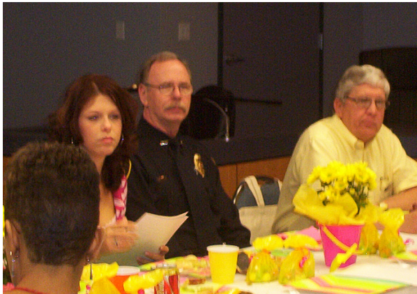
Top right photo: Central Texas Chapter members at their meeting in April.