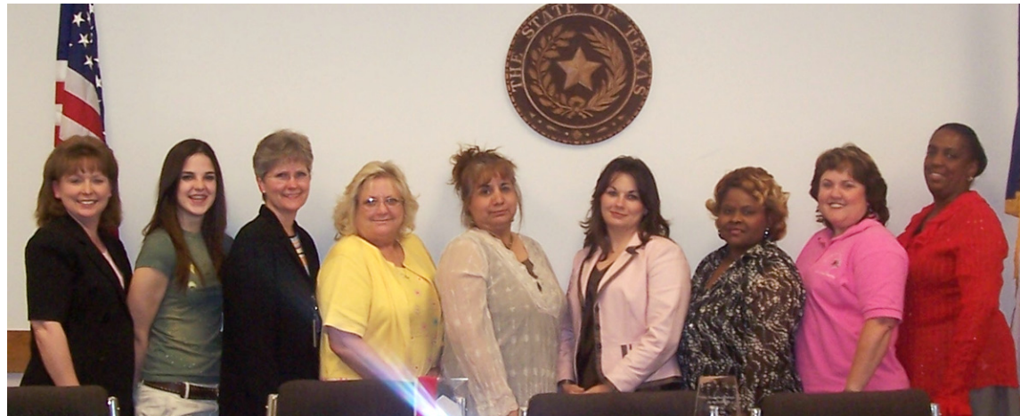
The Pineywoods Chapter at their March meeting in the City of Center.