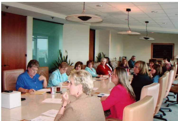
Below: Capital Chapter members at the March 2007 meeting.