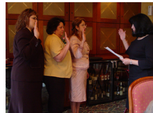
New officers were sworn in at the Lower Rio Grande Valley Chapter's March meeting.