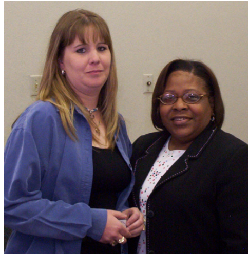
Top photo: April 12 bi-monthly meeting at Groesbeck.