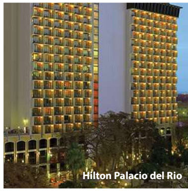
Hilton Palacio del Rio

IIMC REGION IV • ARKANSAS LOUISIANA MISSISSIPPI OKLAHOMA TEXAS