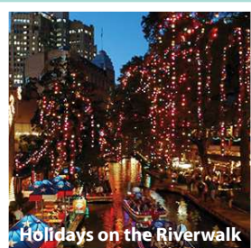
Holidays on the Riverwalk