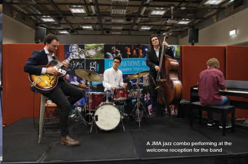
A JMA jazz combo performing at the welcome reception for the band