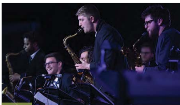
14 UNT College of Music Down Under