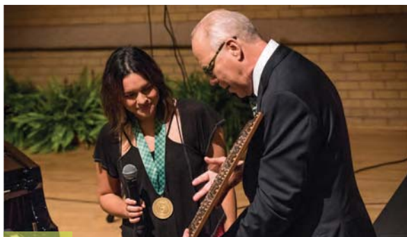
12 Famed Alumna Receives UNT Presidential Medal of Honor