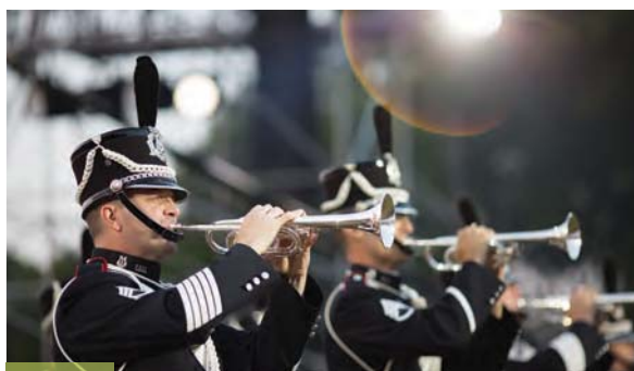
16 Mean Green to Army Green