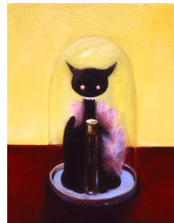
Liquid Kitty , Elaine Pawlowicz, 8"x10", oil on canvas.

Her paintings are speckled with tiny characters that are swallowed up by neon color fields. The style is a type of magical realism and the space is flat with an idiosyncratic perspective. These highly personalized narratives are slightly ambiguous and peculiarly lighthearted.