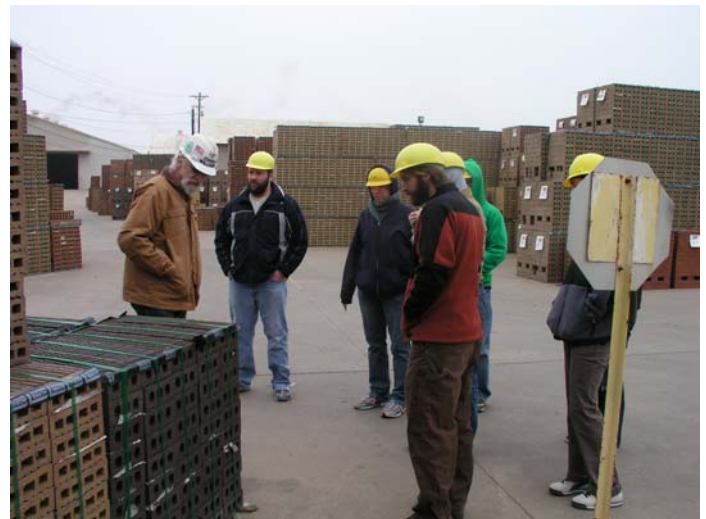
A number of our Clay Guild members getting the formal tour at the Acme Brick plant in Denton, Texas.