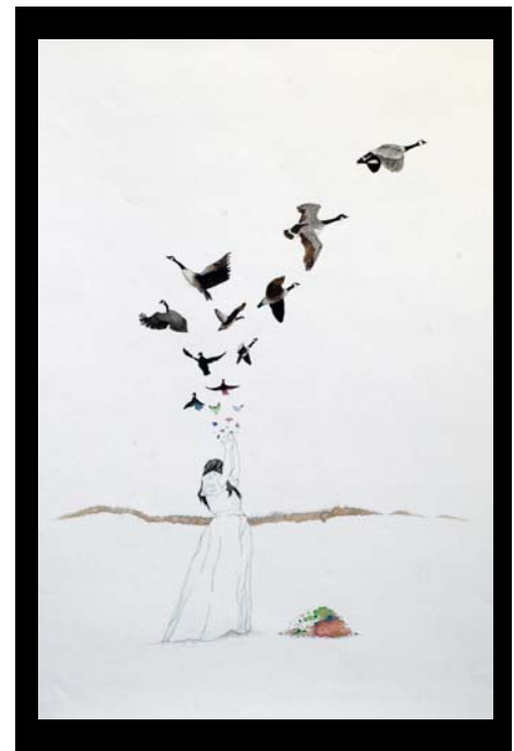
Sister Winter, Mark Raymer, ink on paper.

"THE EXHIBITION DEMONSTRATED THE RIGOROUS CRITICAL INQUIRY, PRACTICAL SKILL-BUILDING AND VISUAL EXPLORATION PRACTICED BY THE ... STUDENTS"