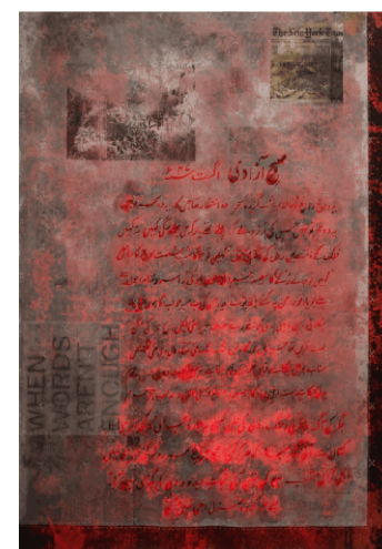
When Words Aren't Enough Anila Agha, mixed media