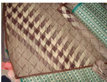
Sample of Ugandan barkcloth weaving technique.