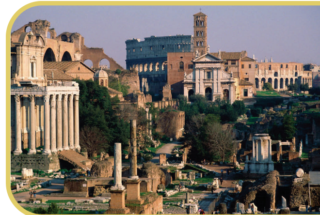
Roman Forum