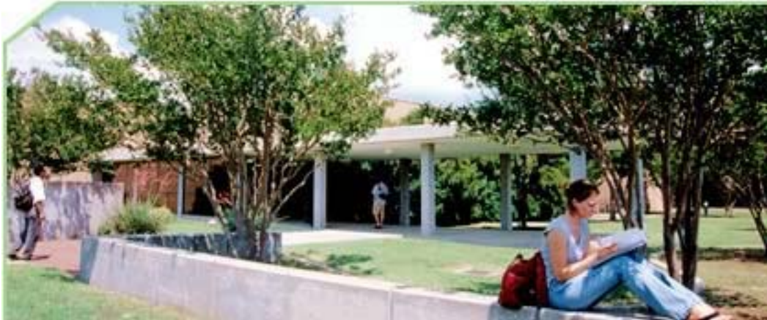
North Texas Research Park: Home of the College of Engineering

The UNT legacy of excellence continues with College of Engineering's experienced and knowledgeable faculty, coupled with modern facilities and laboratories to help you earn a professional degree in engineering, engineering technology, computer science, or materials science. Our innovative project-orientated curriculum will help you to learn advanced engineering practices and skills needed for employment in hi-tech industries. All the programs at UNT's College of Engineering have ABET and/or SACS accreditations.