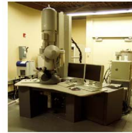
FIB/SEM Dual Beam (CART)

The focus in this laboratory is on the processing and characterization of metals, alloys, intermetallics and composites. Current projects involve production and characterization of bulk metallic glasses and nanocrystalline materials, higher temperature shape memory alloys, metallic biomaterials for bioimplants, production and characterization of automotive aluminum castings and thin film multilayers with metastable structures. Emphasis is on understanding microstructure (nanostructure) — property - processing relationships in these classes of materials. The major researchers associated with this lab are Rajarshi Bannerjee and Michael Kaufman . Recent work with the Air Force Research Lab and Ohio State is focusing on metal-matrix nanocomposites. In addition, Reza Mirshams is associated with this group through his research on characterization of mechanical properties using, primarily, nonindentation.