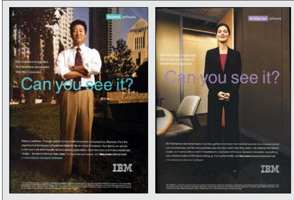
Figure 2. "Can you see it?" IBM advertisements, Business Week , November 17, 2003.

from the government and corporations to build structurally interdisciplinary and collaborative programs. And even fewer seek to initiate the systemic campus-, division-, or department-wide reorganization of the humanities that would be needed to fold interdisciplinary and collaborative work structurally into normal work (to the point, for example, of establishing course relief for grant-raising and project-management duties or tenurable rewards for junior faculty working on collaborative projects). 17