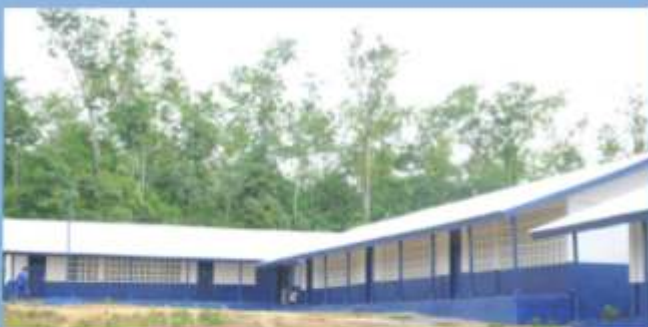
Newly constructed Nyenn Standard Primary School in Todee District.