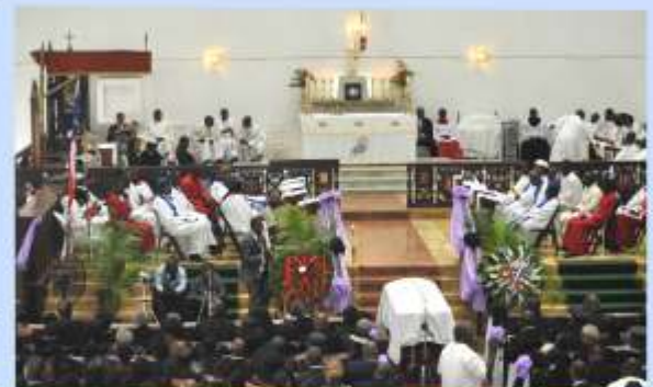
Funeral Service of the late NTGL, Chairman Charles Gyude Bryant; his casket draped in white, sits in the aisle.