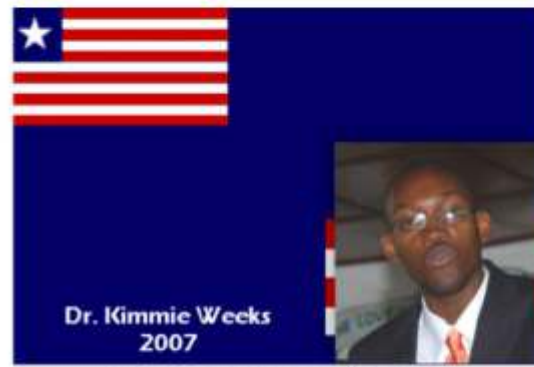
Grand Bassa County