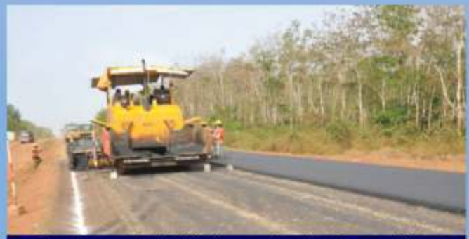
Ongoing road rehabilitation work on the Paynesville Redlight-Gbarnga Highway.