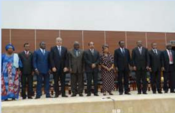
The Chair of the African Union's High-Level Committee of Heads of State and Government, President Sirleaf, poses with other African leaders at the HLC Meeting in N'djamena Chad.