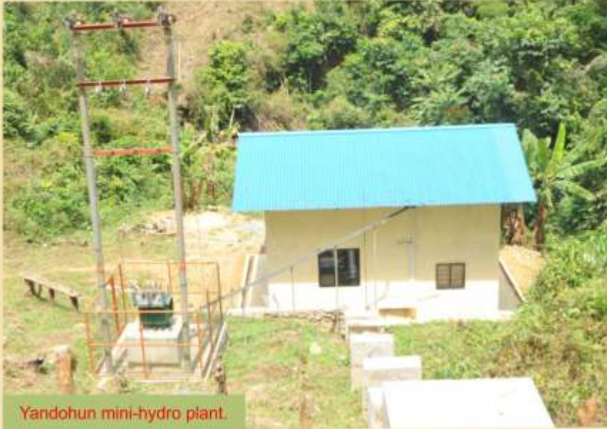
Yandohun mini-hydro plant.

After dusk, much of rural Liberia falls into obscurity as residents have to resort to candlelight, lanterns, or flashlights to snake their way through the darkness of their homes or communities. Where there were once working power plants, only the shell of these structures remain. But not for Yandohun and surrounding towns in Kolahun District, Lofa County.