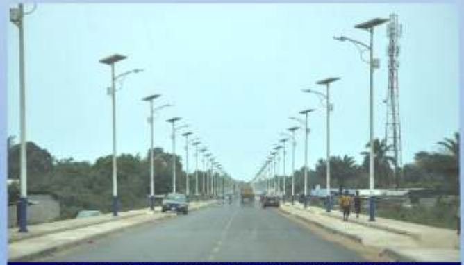
The newly constructed Caldwell-Louisiana Road with solar street lights.