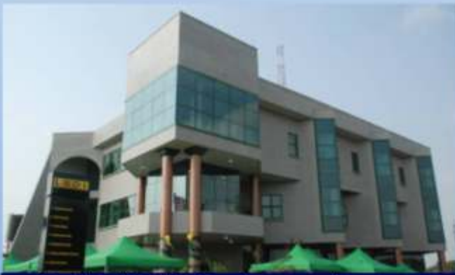
The Liberia Bank for Development and Investment.