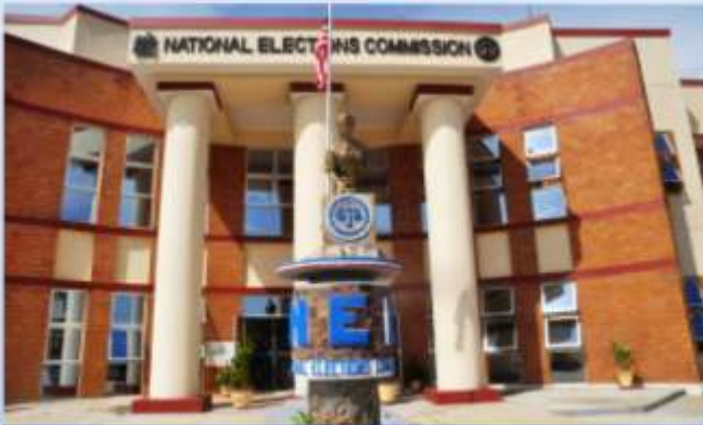
National Elections Commission headquarters.