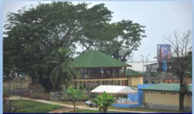
Chevron Monrovia Central Park.