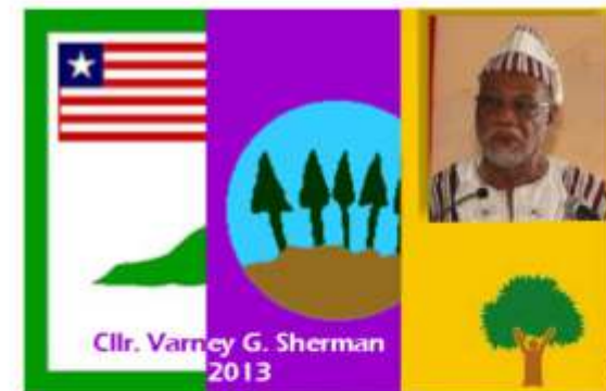
Grand Cape Mount County