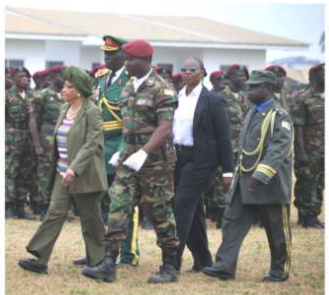
The Commander-in-Chief of the AFL inspects her troops.

Speaking further, the Commander-in-Chief announced the approval of National Defense Strategy, which focuses on Liberia's national defense imperatives and regional peace and security. She said the security challenges the country faces require a clear assessment of the strategic environment and the resources necessary to construct a durable, flexible, and dynamic strategy that emphasizes human security.