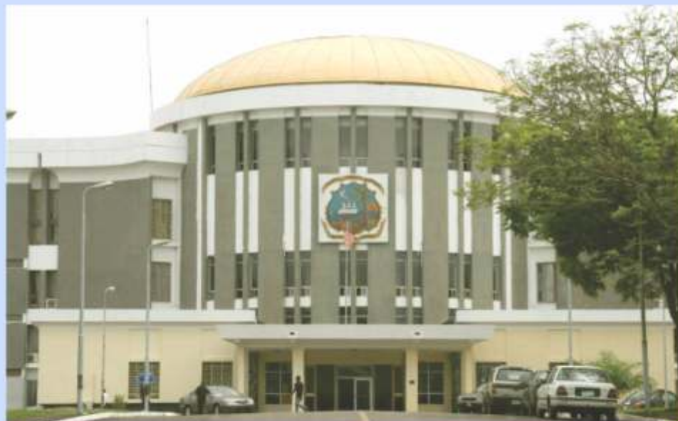
The Capitol Building.

However, since the ascendancy of President Ellen Johnson Sirleaf, the citizens of Montserrat have stressed that their main priorities are: roads, education, and health. They noted that without roads, it is not possible to develop the county, since so many areas are inaccessible by vehicle, and they miss out on basic services such as education and health. Improved health services are needed to address outbreaks of diseases and to assure the productivity of the labor force. Education is needed to combat the high illiteracy, particularly among women, while education, together with vocational skills, allow for a