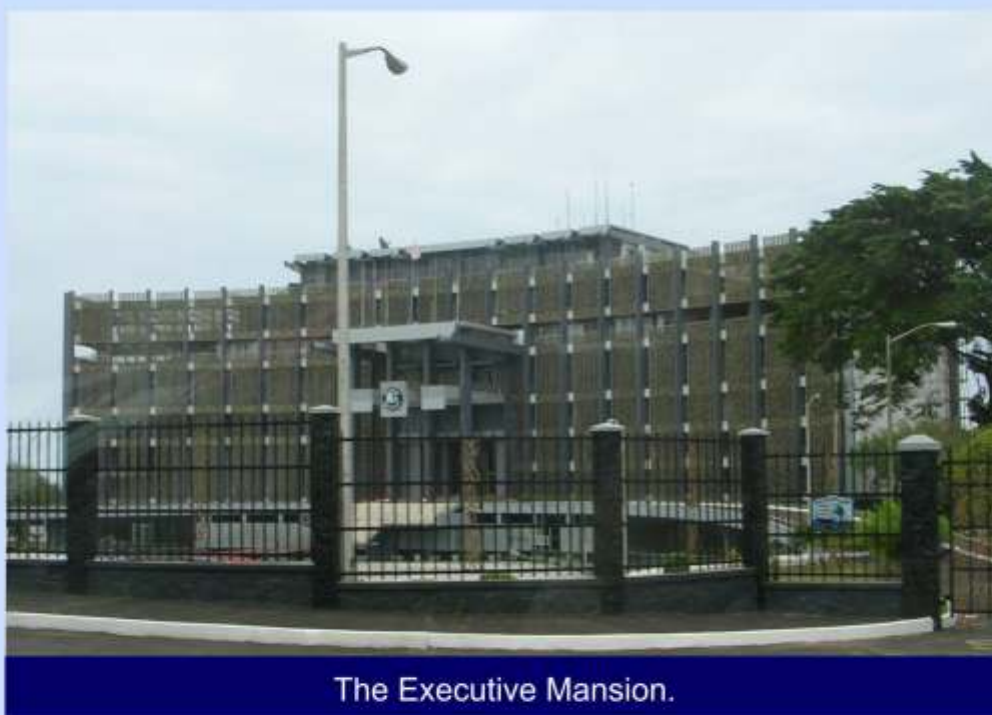
The Executive Mansion.

At the foundation of the country, Montserrado is the oldest County in Liberia. It was the first of three counties to sign the Declaration of Independence on July 26, 1847. Before then, in 1821, the American Colonization Society (ACS) led a group of African American freed slaves who settled on Providence Island, along the Mesurado River, in what is now Monrovia, Liberia's capital city.