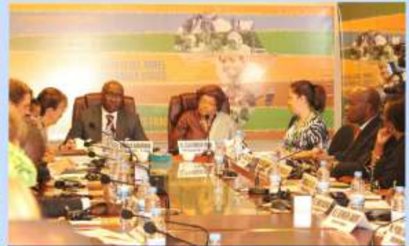
AIFB President, Dr. Donald Kaberuka, and President Ellen Johnson Sirleaf at the High-Level Panel Meeting on Africa's Fragile States in Monrovia.