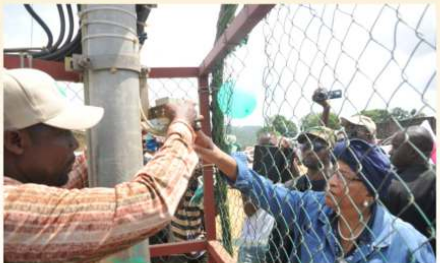
President Sirleaf switches on transformer at power plant.

In an effort for the community to take ownership, the RREA has trained 100 local residents to operate and manage the facilities, including switching, connection, collecting bills, and maintenance.