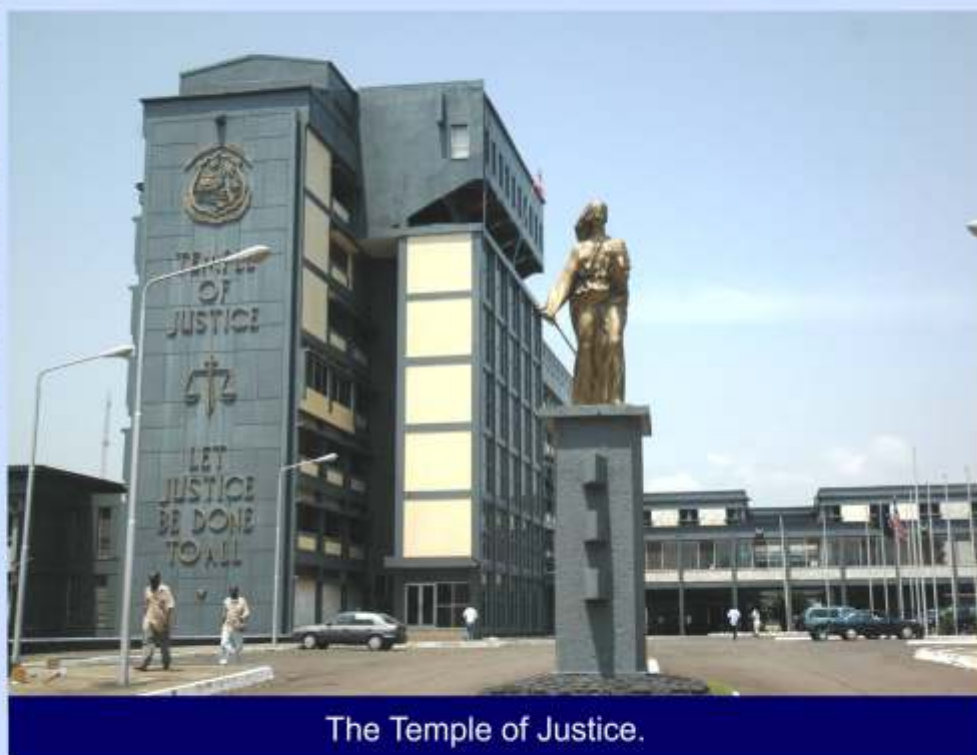
The Temple of Justice.

We remember the country she inherited in 2006: a collapsed economy, dysfunctional institutions, damaged infrastructure, virtually bare minimal basic services for a people who had virtually lost hope. After only eight years in office, President Sirleaf and her team have turned a failed state into a country that has regained its standing among the comity of nations. Despite recent setbacks, President Sirleaf has promised to restore the declining economy to its full potential.