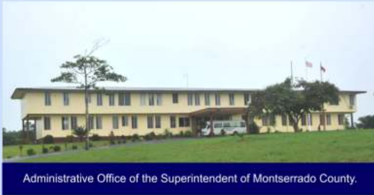
Administrative Office of the Superintendent of Montserrado County.

B entol City, previously known as Bensonville, is a small township in Careysburg District, some 16 miles (26 kilometers) from Liberia's capital, Monrovia. It is the administrative capital of Montserrado County.