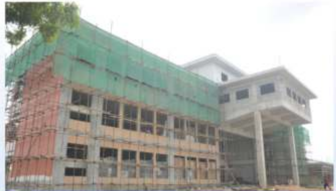
The new Monrovia Vocational Training Center complex under construction in Paynesville.