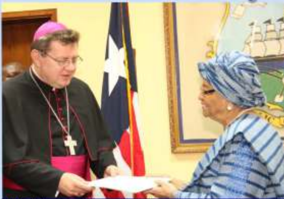
H.E. Miroslaw Adamczyk, Ambassador Extraordinary and Plenipotentiary (Apostolic Nuncio) of the Holy See.