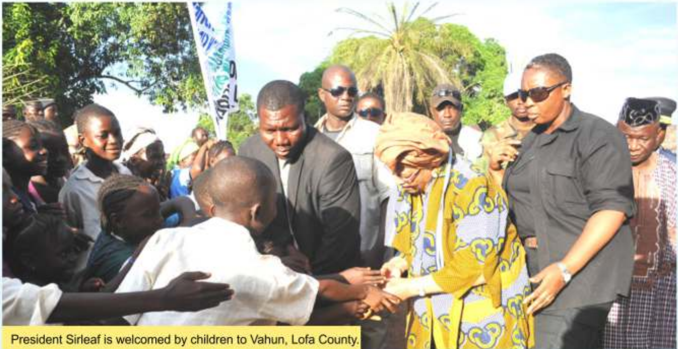
President Sirleaf is welcomed by children to Vahun, Lofa County.

For the second time since the country's independence, citizens of Vahun, Lofa County, were able to receive a sitting President of Liberia when Madam Ellen Johnson Sirleaf paid a two-day visit there in February 2014. She not only visited Vahun, but also slept there.