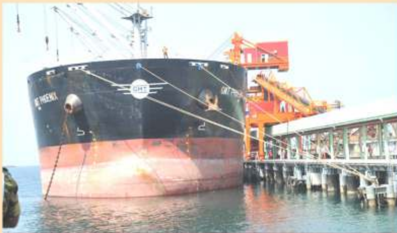
GMT Phoenix being loaded with China Union's first shipment of 50,000 metric tons of iron ore.

One of the largest investors in post-conflict Liberia, China Union, has launched its first shipment of about 50,000 tons of iron ore from its newly constructed pier at the National Port Authority premises. The concession projects to export 500,000 metric tons of iron ore by the end of December 2014, approximately 50,000 tons per month.