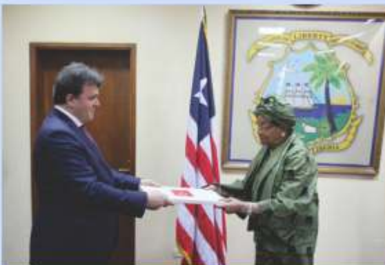
H.E. Senturk Uzun, Republic of Turkey.