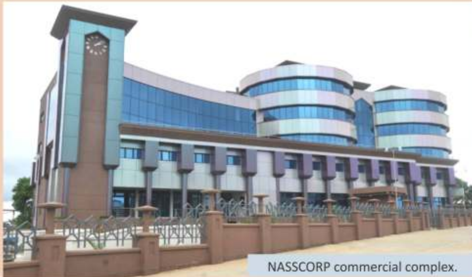
NASSCORP commercial complex.

Executive Mansion is renovated by a Liberian company, there will be greater commitment and passion for the work, as was done in the construction of the NASSCORP complex. "There is no way that others can do it for us better than ourselves and we all must have this at the back of our minds," the Liberian leader said, amidst loud cheers. She added: "There are some people who are politically charged, misguided and ill-informed. They will look at this building and say this is nothing. If this is their