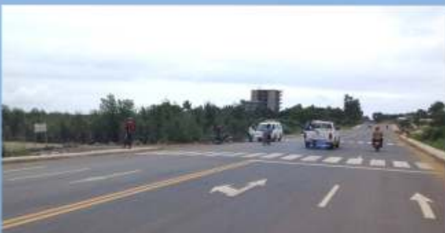
The SKD Boulevard in Congo Town.