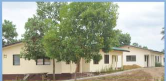
National Housing Authority low-cost housing estate nearing completion in Jah Tondo Town, Brewerville.