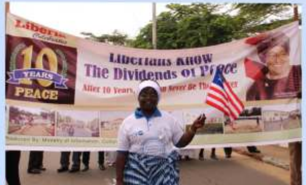
One of the banners depicting a clear message as Liberians celebrate 10 years of peace.