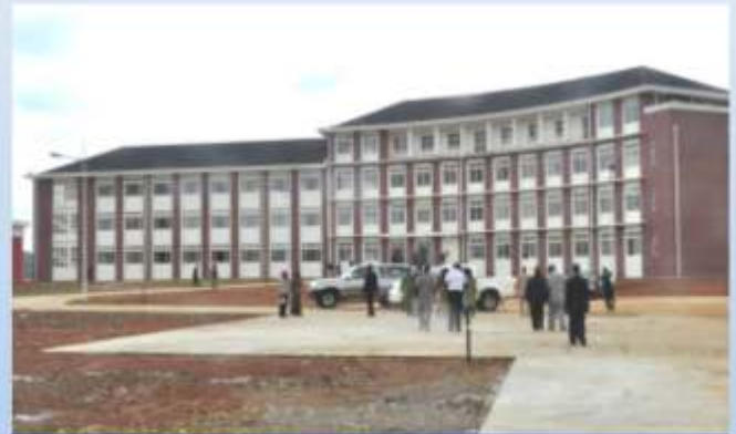
University of Liberia Fendell Campus.