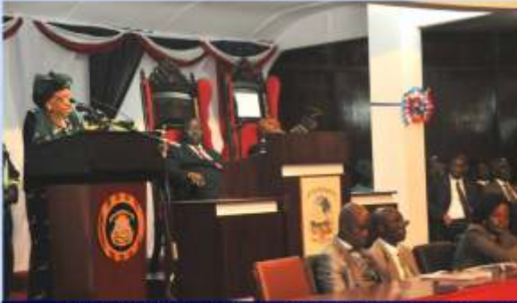
President Sirleaf delivers 9 th Annual Message to the National Legislature. She, House Speaker Alex Tyler, and Vice President Joseph Boakai stand as the National Anthem is played following her address to the 53 rd Session.