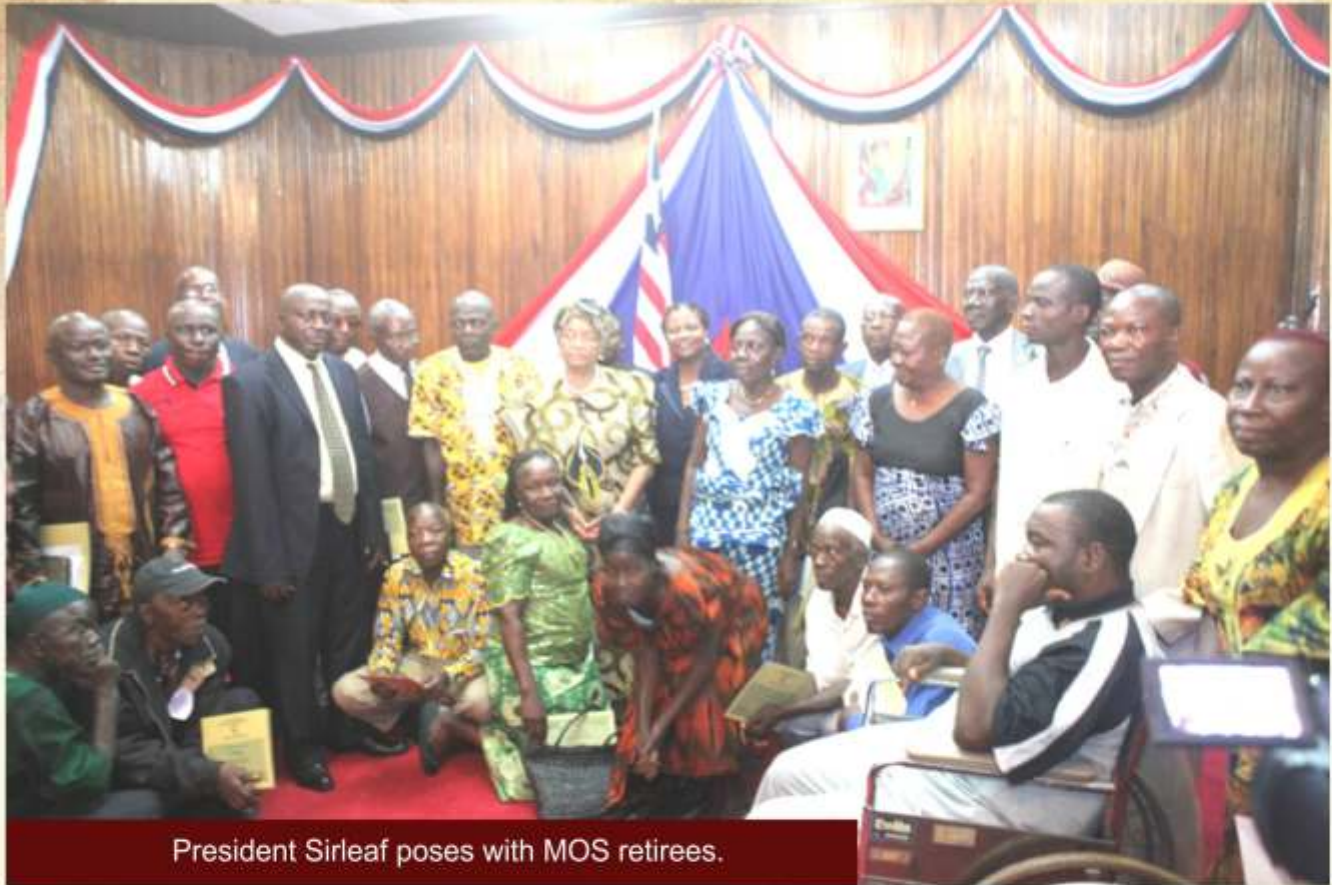
President Sirleaf poses with MOS retirees.

After many years of dedicated and committed service to the Government of Liberia, specifically the Presidency, 26 personnel of the Ministry of State for Presidential Affairs have been honorably retired.