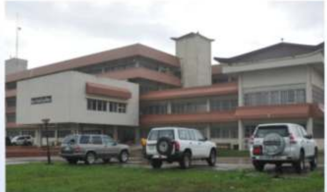
Ministry of Health and Social Welfare.