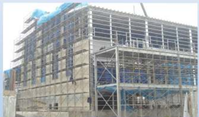
Japanese Heavy Fuel Oil Plant at the Liberia Electricity Corporation.