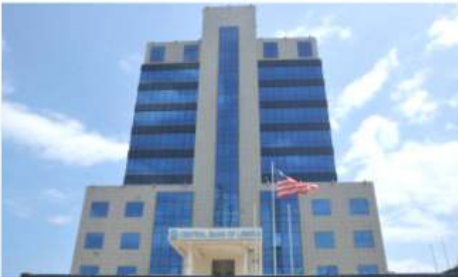
Central Bank of Liberia under construction.