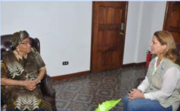
President Sirleaf and Her Royal Highness Princess Haya bint Al Hussein of Jordan.