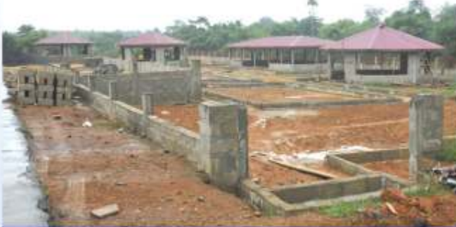
Peace Park under construction in Bentol.