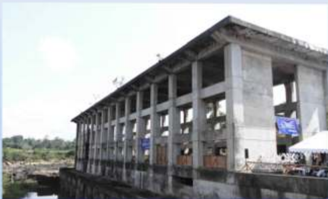
Mount Coffee Hydro Power Plant under renovation.