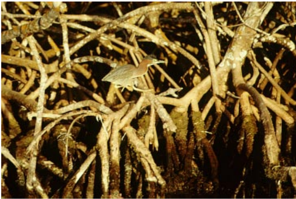
Green-backed heron forages from mangrove prop roots, Everglades National Park

ous mangroves and marshes (both brackish, fresh), flooding duration (or hydroperiod), and temporal variability in salinity.