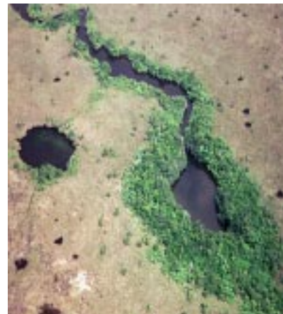
Interface between mangroves (dark green) and brackish marsh (light green)

The USGS Florida Caribbean Science Center's Restoration Ecology Branch at Florida International University is conducting research on restoration of coastal marine waters of South Florida. Critical research for restoration of the faunal support function of the mangrove zone and adjacent waters involves understanding the responses of mangrove-associated fauna to changes in the quality, quantity, timing and distribution of freshwater flows. Initial efforts will focus on fish and macrocrustaceans (shrimp and crabs). A second high priority is to link avifaunal use of mangroves and adjacent inland marshes to patterns of hydrology and secondary productivity of forage organisms.