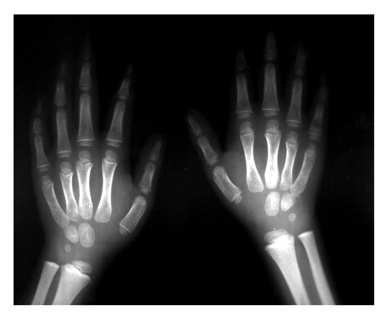
Figure 2. Longbone radiographs of hands

"Lead lines" in five year old male with radiological growth retardation and blood lead level of 37.7\mu g/dL .