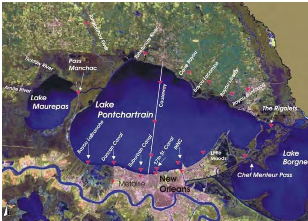
Figure 1. Locations of sampling sites used by the U.S. Geological Survey during a 3-week survey from September 13 to 29, 2005.

Fecal-indicator bacteria ( Escherichia coli , enterococci, and fecal coliform) concentrations in samples collected from September 13 to 29 ranged from the detection limit to 36,000 colony-forming units (cfu) or most-probable numbers (MPN) per 100 mL of water. Reporting units (cfu or MPN) varied based on the nature of the measurement tests. Fecal-indicator bacteria concentrations in the lake following Katrina generally were well below applicable water-quality criteria; those measurements that showed high concentrations relative to the criteria did not support the assumption that pumpage from New Orleans would lead to widespread contamination of the lake. This observation may be partially explained by the combined effects of dilution and the various processes that