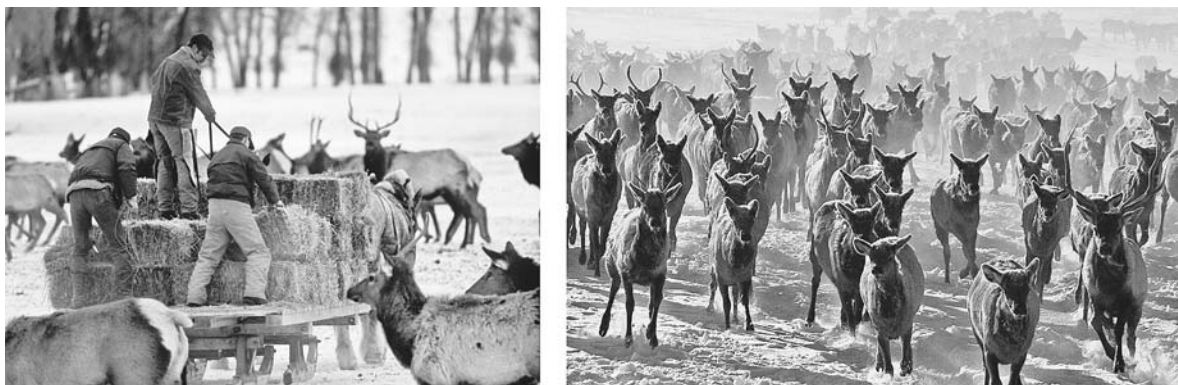
PLATE 1. Feeding time at the National Elk Refuge, Wyoming, USA.

was highly correlated with seroprevalence in the weighted linear regression (Fig. 1C), it appeared to be less important in the logistic regression approach (Table 1, Appendix B). Feedgrounds that started earlier also tended to end later. Therefore, some of the importance of begin date may be due to its association with end date. We believe that late-season abortions, and the associated brucellosis transmission events, are the mechanism driving the higher brucellosis seroprevalence on feedgrounds with longer feeding seasons. If the associations shown here reflect causal relationships, a 30-day decrease in the length of the feeding season (due to earlier snowmelt or altered management) would result in a drop in brucellosis seroprevalence of approximately two-thirds (Fig. 1C).