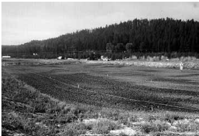
Figure 2. Land treatment unit.

Surface Soil Bioremediation. The LTU consists of two adjacent 1-acre cells, lined with low-permeability materials to minimize leachate infiltration from the unit (see Figure 2). Contaminated soil is applied to the cells in 9-in. lifts and treated until target contaminant levels are achieved within each lift. Evaluation of the effectiveness of the land treatment includes sampling the soil in the LTU, studying field-scale treatment and toxicity reduction, analyzing the influence of moisture and temperature, and evaluating the downward migration of PAH and PCP within the LTU.