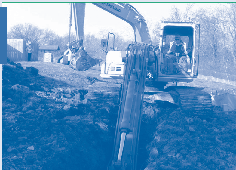
Figure 3. Trench depths for the Whiteman AFB biobarrier system varied from 10 to 20 feet, depending on elevation of underlying competent shale bedrock.