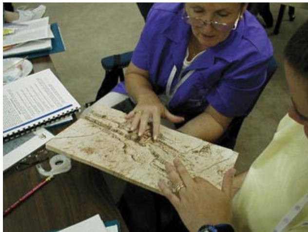
Workshop participants work with tactile map of Vallis Marineris on Mars; part of the Mars Education Activities being developed by SSE/ASU.

special needs teachers and NASA personnel who develop educational materials and exhibit resources. Attendance for the three-day workshop at the National Space Science and Technology Center in Huntsville, Alabama included 11 formal and informal educators from 10 states, 4 presenters, and 15 guests from NASA education centers, the South Carolina School for the Deaf and Blind, and corporate America. Workshop activities were taught ‘disabilities-on’, meaning that each participant worked through the lessons experiencing a variety of roles during the three-day workshop. The various disabilities simulated by the participants included: parapalegic, quadrapelegic, multiple motor disabilities, ADD/ADHD, varying degrees of visual and hearing impairments, and various verbal communication impairments.