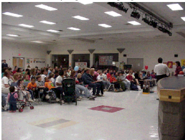
Family Science Night in Rio Rico, Arizona, February 2002. 1,500 parents, students, and educators attended the event, which included dozens of family science stations. One of the concurrent sessions was a 'performance' by a space scientist, attended by 250. The National Team also conducted 87 class visits to 4,300 students.

Philosophy of Approach: The program is designed to gradually build a local infrastructure in a community — a Local Team — that can provide self-sustaining programming using national resources. This Team reflects the diversity of the community, including K-12 school districts, informal science education organizations, civic and business groups, colleges and universities, and research organizations. Sustainability is viewed as a key to success, and a deep commitment to assessment provides for ongoing evolution of every aspect of the program.