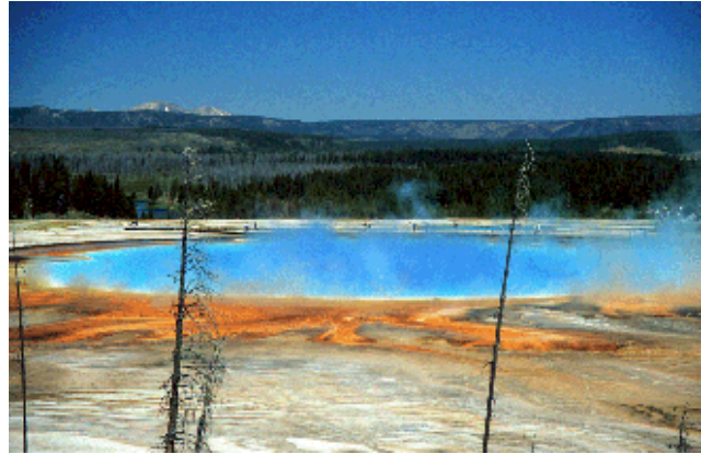
Grand Prismatic Pool, Yellowstone National Park. Colorful algae mats thrive on the pool rim.

develop hikes and talks. The Guide will be published and available for purchase from the gift stores throughout the park. It will also be available for virtual visitors through research libraries in the national park system, the Yellowstone National Park Web site and the NAI site [ http://www.nai.arc.nasa.gov/ ].