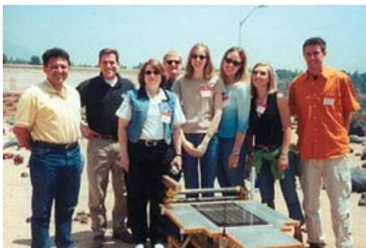
3-M Team at the Rover Yard

"Seeing an actual rover was amazing. It is something most people only hear about. When we were watching it climb over rocks in the Mars