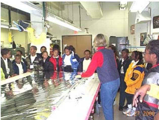
SUNBEAMS students touring the thermal blanket assembly room at NASA GSFC.