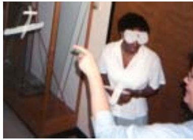
Blindfolds make glider flying a challenge!

The participants were paired with a colleague with a different 'condition' to facilitate lesson completion and to share their thoughts as they executed the exercises. OSS activities presented included posters, CD ROMs, web sites, music, hands-on activities from each of the four OSS education themes and the contents of the Multisensory Space Science Kit (See Voyages , January 2001, http://spacescience.nasa.gov/education/news/ for information on the Multisensory Kit.) In instances where the participant could not manipulate a keyboard, or