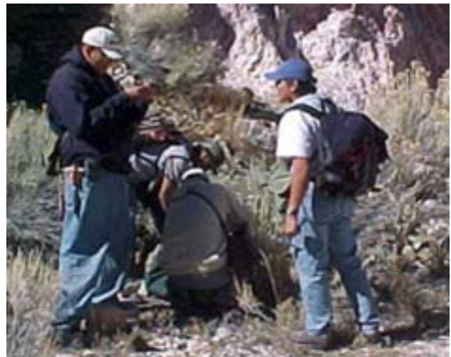
NASA OSS program provides hands-on field experience for SIPI geology students.