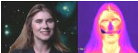
Explore the uses of visible and infrared images at the SIRTF Website.

In addition, SIRTF is working closely with other infrared and astronomy missions to develop a well-rounded public education program that goes outside the primary mission of the observatory. Partnerships with groups that deal directly with standards-based curriculum development have also been formed. The CAPSI (Caltech Pre-College Science Initiative) has been funded by SIRTF to develop a series of basic physics activities to be included in Whyville , ( http://www.whyville.net ), their popular web-based science education site intended to support both home and classroom-based learning through scientific inquiry.