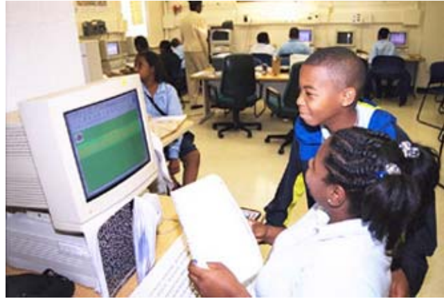
Students in computer lab putting up web pages describing their week at NASA GSFC.

During the school year, each teacher brings a class of up to 30 students to Goddard for a week of total immersion in math and science activities. The activities are standards-based and designed to give the students an understanding of the actual methods used by Goddard scientists, engineers, and technicians to do space science and technology. Following their week at Goddard,