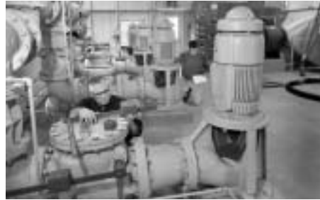
8. WET WELL stores the filtered water before it is pumped into the air-stripping towers. While Jack Kulesa (background) inspects the wet-well pump seals, Richard Lutz works on a check valve.