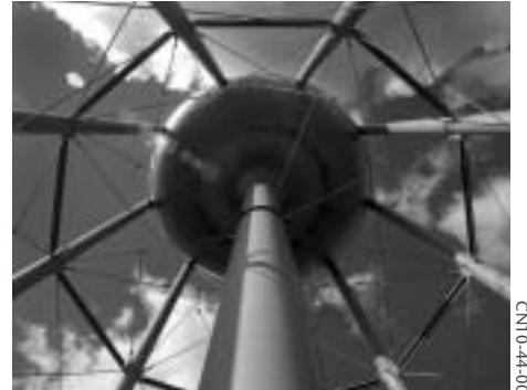
12. ONE-MILLION-GALLON WATER STORAGE TOWER , as viewed from its base, is the larger of the Lab's two water towers. Built in 1985, and located at Cornell and North Sixth Street, this tank is 126 feet above the ground; its bowl is 75.5 feet in diameter. Located next to Police Headquarters, Bldg. 50, the other water storage tank holds 300,000 gallons and was built for the U.S. Army in 1941, when the site was Camp Upton. Water from the two towers is delivered on site at a pressure of 55 to 70 pounds per square inch via 45 miles of distribution pipe. The piping is a mix of cast iron dating from World War II Camp Upton, transite, plastic, and cement-lined ductile iron. When pipe is added or replaced, cement-line ductile iron is used.