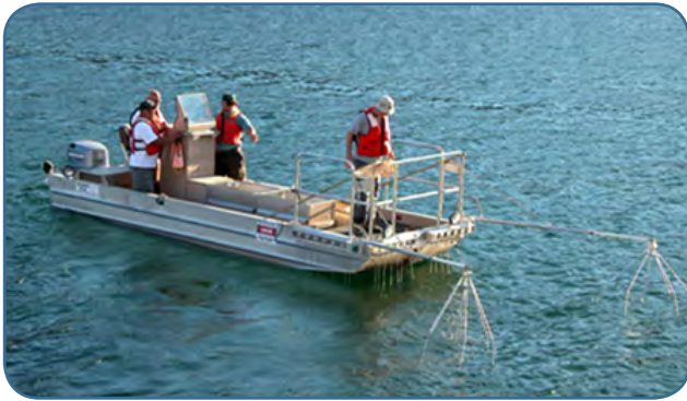
Specially designed electroshocking boat for sampling fish in Lake Mead.

further characterize environmental contaminants in Lake Mead including emerging compounds such as pharmaceuticals and personal care products. Data from this new study would also serve as a baseline to monitor the reproductive condition of fish in Lake Mead and as reference point for other research and monitoring studies of fish reproduction. The study compared observations made in Las Vegas Bay against those in a reference site, Overton Arm. Results for a number of biomarkers of reproductive condition were described by Patiño and others (2003). Male carp from Las Vegas Bay had smaller testes (gonadosomatic index) and higher levels of testicular macrophage aggregates (biomarkers of contaminant exposure)