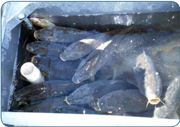
Common carp held in livewell before processing.