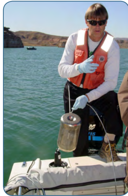
Hydrologist deploying passive samplers to sample organic compounds in Lake Mead.

A pilot study of Lake Mead was conducted in 1995 by the U.S. Geological Survey (USGS) and other Federal agencies including NPS and FWS. The purpose of this study