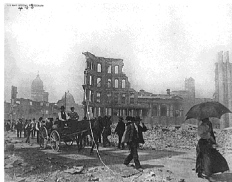
San Francisco in ruins

At 5:12 am, April 18, 1906, a catastrophic earthquake measuring near 8 on the Richter Scale shook California, rupturing 270 to 290 miles along the San Andreas Fault from Humboldt County in the north to San Benito County in the south. Towering, massive, fast-moving post-quake fires fueled and compounded the destruction, raging through San Francisco for three days following the quake, due to its having shattered the city's safety infrastructure, including the entire water system. In the aftermath of the earthquake and fire, over 250,000 people--more than half of San Francisco's population--became homeless. Refugee camps sprang up