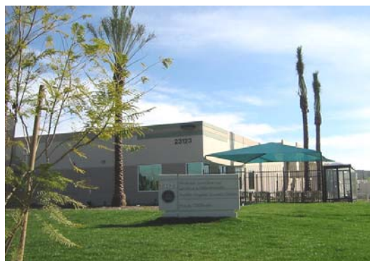
Federal Records Center in Riverside, CA

In honor of our veterans and in support of their families, during the Veterans Day Holiday weekend we will host open houses at each of our regional archives locations and the National Personnel Records Center (NPRC).