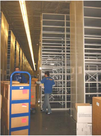
Stack area, Riverside FRC