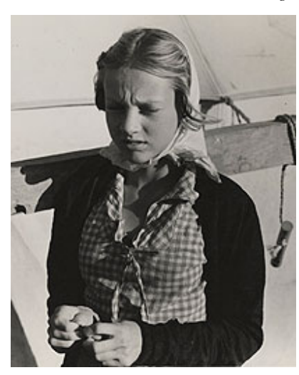
A young FSA camp resident.