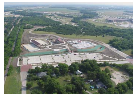
Allen, Texas: Allen Station Park