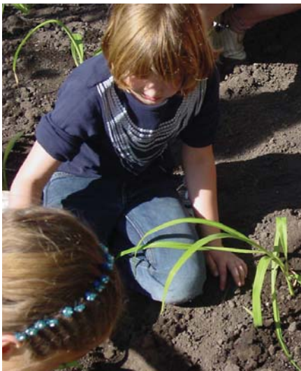
Platte County, Missouri: Green Hills Wildlife Preserve