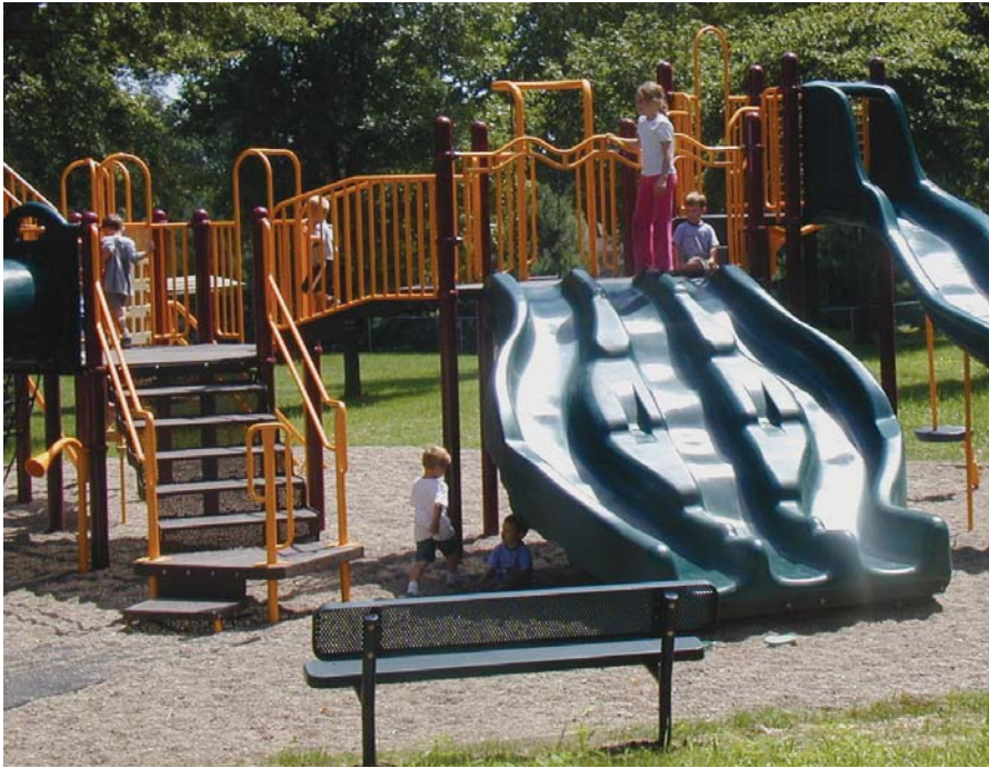
Treynor, Iowa: East Park

"Having taken my grandson to the new playground many times, I cannot express my gratitude for the DNR's involvement in getting us a LWCF grant. I have witnessed a ten-fold increase in the usage of the new equipment by our kids."