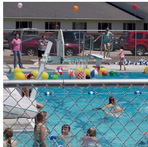
Hemingford, Nebraska: Community Pool

"Your assistance made our dream of a new pool come true. For small communities, these dreams are accomplished only with strong community support and great programs such as the Land and Water Conservation Fund."