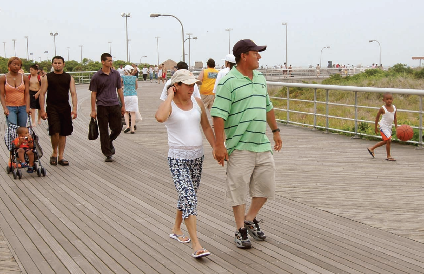
Long Island, New York: Jones Beach State Park