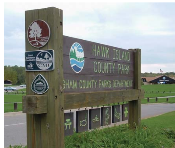
Ingham County, Michigan: Hawk Island County Park