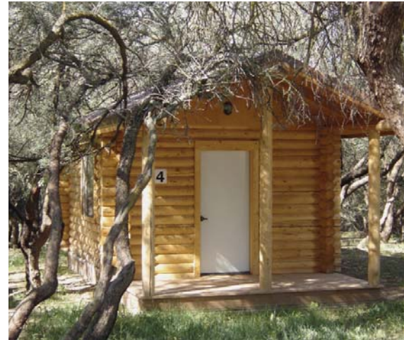
Santa Cruz County, Arizona: Patagonia Lake State Park facility upgrades include new modular restrooms and showers in the two campgrounds and adding electricity to over 100 campsites.

In Iowa, the unmet need was estimated at $1.1 million, unfunded projects include community aquatic centers in Clear Lake, Eagle Grove, Manly, and Melbourne; a playground project in Scharnburg; trail acquisition and development in Des Moines County; skate parks in Carroll, Newton and Rock Rapids; campground and park revitalization work in Allison, Clinton, Creston, and Cherokee and Mitchell counties.