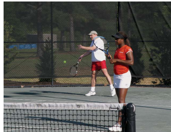
Cullman, Alabama: Whatley Park Soccer and Tennis Facilities