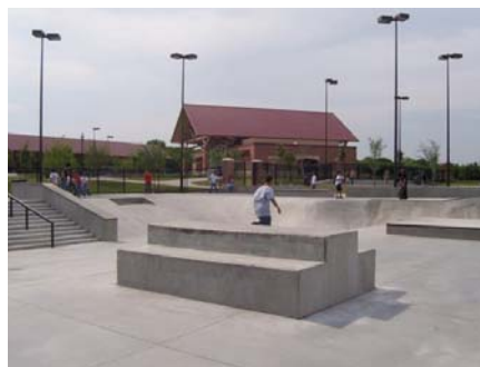
Allen, Texas: The Edge at Allen Station Park

The Edge, as the new active recreation facility is known, features a concrete skate park, two roller-hockey rinks, BMX track and youth center. The skate park is now the largest outdoor facility of its kind in the state.