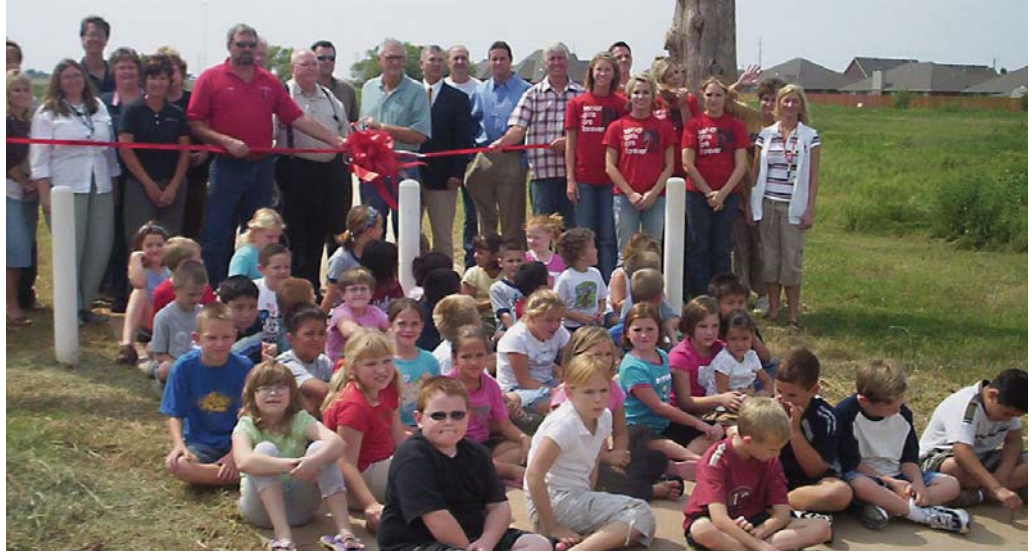
Kingfisher, Oklahoma: Briscoe Park Opening