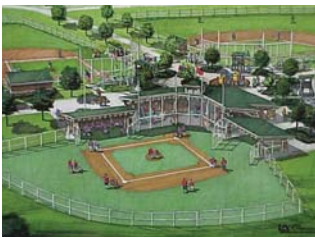
Cullman, Alabama: Field of Miracles

The Land and Water Conservation Fund is a visionary program established by Congress to preserve, develop and assure accessibility to quality outdoor recreation resources for active participation in recreation and "to strengthen the health and vitality of the citizens of the United States (Public Law 88-578)." In a landmark study more than forty years ago, the Outdoor Recreation Resources Review Commission championed the vital connection between local recreation facilities and public health, the very same connection prevalent in today's prescriptions for creating healthy communities. Projects are listed by county with congressional districts in parentheses. Images featured in this section highlight both current and recently completed LWCF projects.