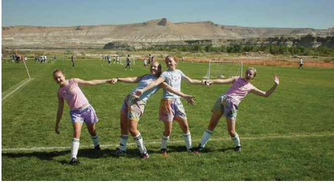
Green River, Wyoming: Soccer Fields