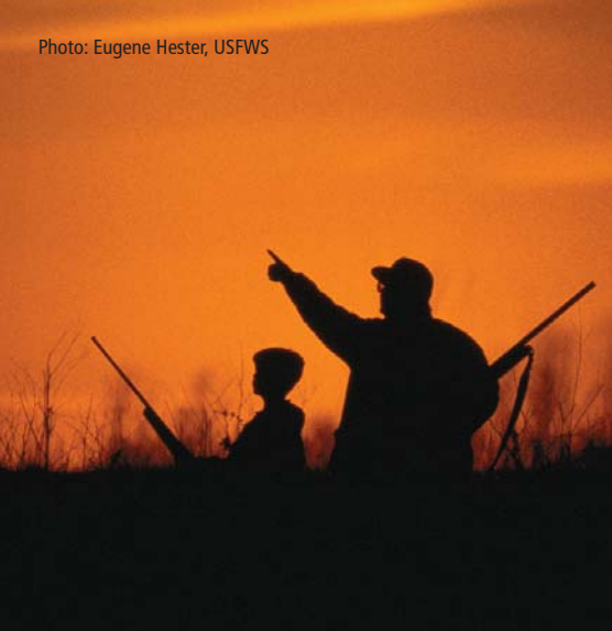
Williamsburg, Virginia: York River State Park