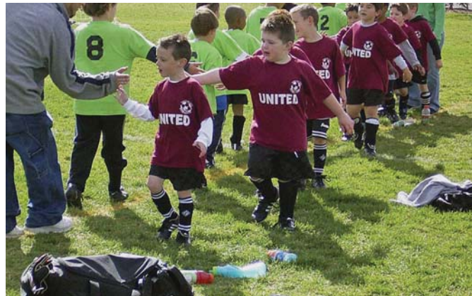
Pawtucket, Rhode Island: McKinnon Alves Soccer Complex Recognized throughout the state as one of its premier soccer facilities, this former brownfield site was remediated and donated to the City to develop into a municipal soccer complex.