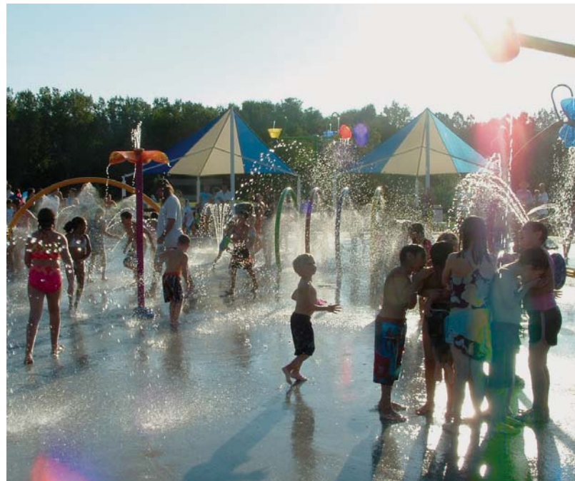
Ingham County, Michigan: Hawk Island County Park