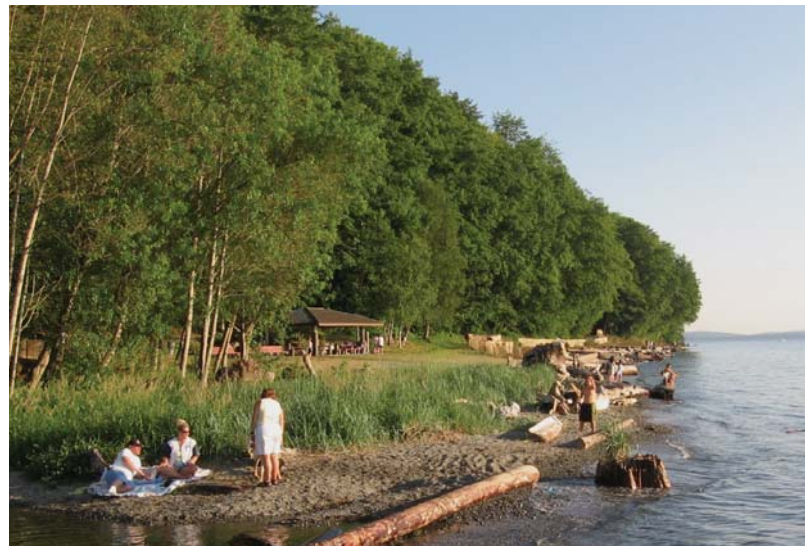
Burien, Washington: Seahurst Park

Improvements at Seahurst include renovation of a shoreline trail, improved beach access for visitors of all abilities and restoration of stream and wetland areas.