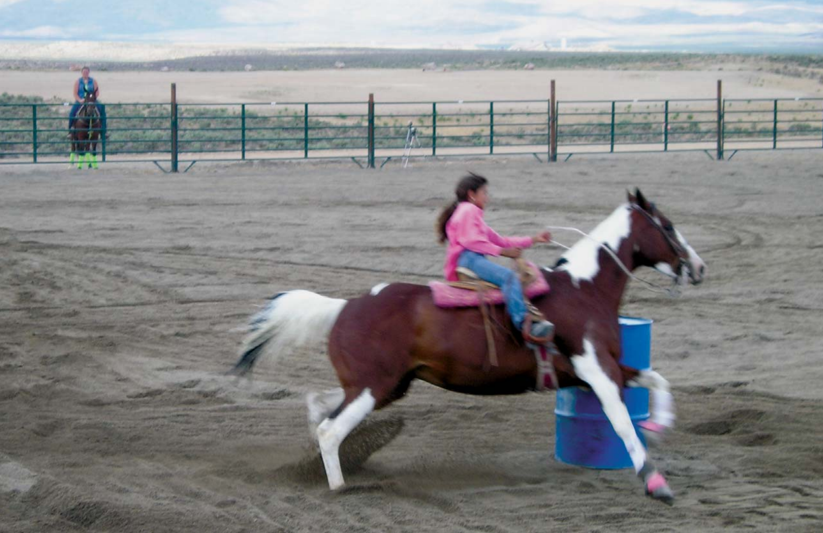
Carlin, Nevada: Equestrian Park