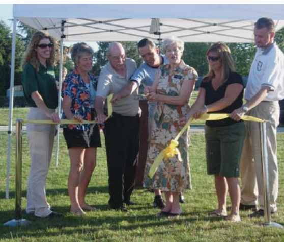
Oregon City, Oregon: Wesley Lynn Park

“As Oregon City’s first new park to be opened in more than 23 years, we are delighted that the Wesley Lynn Park project has been completed. The park provides green spaces for active and passive recreation, offering amenities identified as high needs in our community in an area historically lacking in parks and open space.”