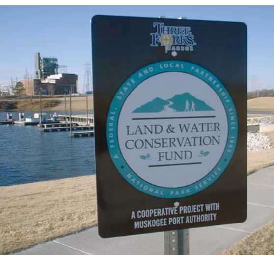
Muskogee City, Oklahoma: Three Forks Harbor