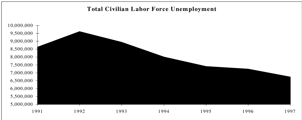
Chart 2. Total Civilian Labor Unemployment, Professional Specialty Occupations Unemployment, and All Artist Occupations Unemployment: 1991 -1997